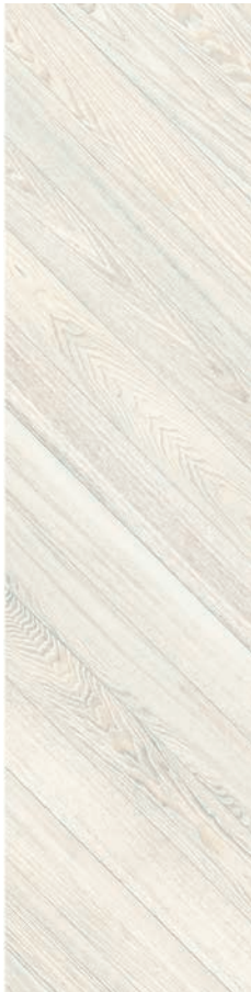
37.5 x 150 cm (14.77 x 59.06) RF.CH.BLH.1560