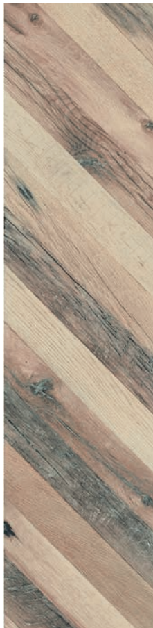
37.5 x 150 cm (14.77 x 59.06) RF.CH.NAT.1560